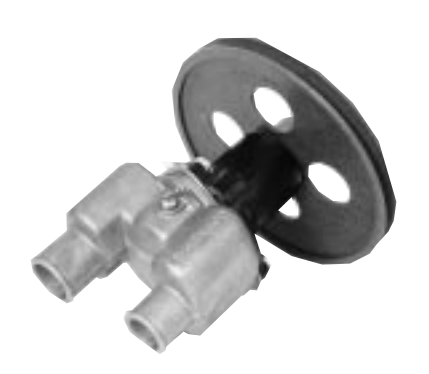
G9901 & G9903