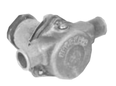
G30-2 & G30-2B